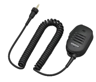
KMC-55 [W] SPEAKER MICROPHONE (IP54/55/67, PF Key, 2.5 D EP Jack)

EMC-13 [W] CLIP MICROPHONE WITH EARPHONE (STD)