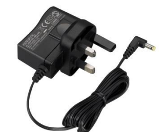
KSC-44SL [T] AC ADAPTER (UK Plug) (SINGLE)

KSC-44SL [E] AC ADAPTER (EU Plug) (SINGLE)