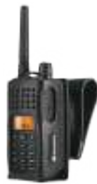
Leather Carry Case