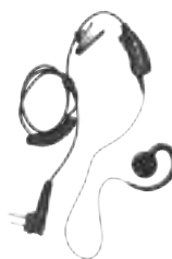
Swivel Earpiece with In-line Microphone and PTT