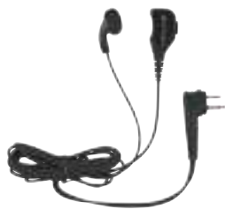
Earbud with In-line Microphone and PTT