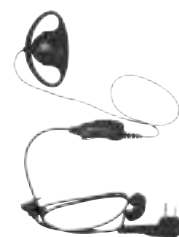
D-Style Earpiece with In-line Microphone and PTT

XT600d Series radios are compatible with XT400 Series accessories except the carry holster and leather case.