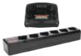
Single and Multi- Unit Chargers